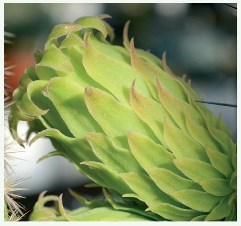
Fig. 7 Leaves on the exterior of a flowering branch of Pachycereus gaumeri . (The true flower parts such as petals, stamens and carpels are located completely within this branch.) Note the numerous large leaves here; the branch is 60mm long