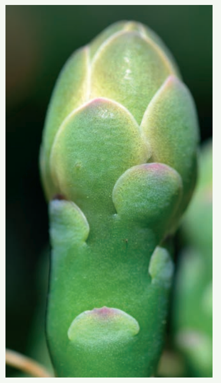
Fig. 5 The beautiful scales on Gymnocalycium flowers are actually leaves with stomata and photosynthetic tissue. Gymnocalycium buenekeri

15 leaves were larger, being up to 13mm long by 4mm wide. Leaves continued to be progressively longer and wider up the flowering branch, with the middle 28 leaves being 15–30mm long and 6–9mm wide. The uppermost 41 leaves were as much as 44mm long and 12mm wide.