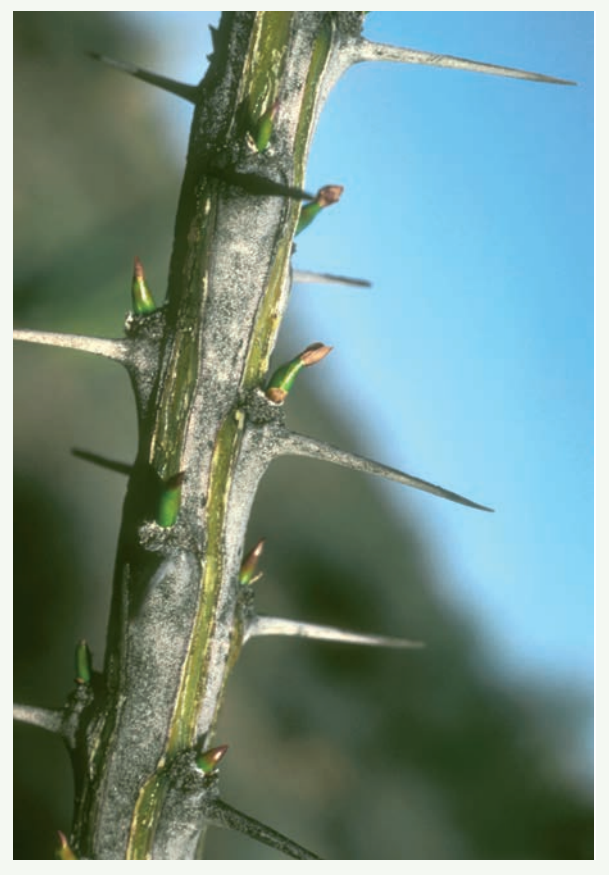
Fig. 4 Just days after a rain, this ocotillo is beginning to make leaves at every axillary bud. Prior to the rain, this shoot would have appeared almost lifeless

The flowering branch that I examined was 60mm long from the point where it was attached to the stem to the open petals, and its opening was 53mm in diameter; it weighed 24.4 grams. The leaves were removed one by one and measured (Fig. 8). There were 92 leaves that were green, plus another nine leaves that intergraded into petals, being pale green. Petals were white. Of these 92 green leaves, the ones at the base of the flowering branch were smallest, eight being less than 7mm long and less than 3mm wide. The next higher