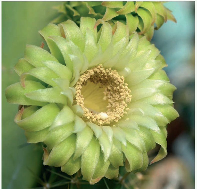
Fig. 6 Just outside the stamens are white petals of a Pachycereus gaumeri flower, and these are surrounded by green structures that are actually leaves on the flowering branch

When measuring leaf area, some people measure only the area of one side. This is appropriate if the main photosynthetic cells are located only next to the upper surface, the side that receives sunlight. The area of the upper side is then correlated with the amount of sunlight captured. In most leaves, almost all the stomata (pores) that allow the absorption of carbon dioxide are located in the underside of the leaf; in these leaves the surface area of the lower side of the leaf gives an estimate of the ability to absorb carbon dioxide. On the other hand, in many succulent leaves, photosynthetic cells are located next to both the upper and